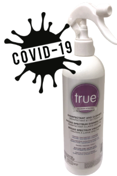
500 ml TRUE Disinfectant All Purpose Cleaner