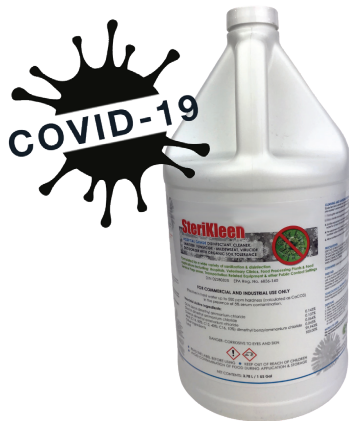
1 Gallon Refill