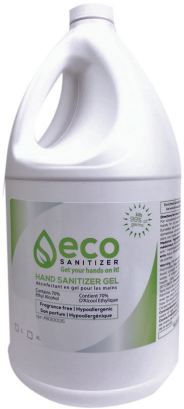
4 L Refill