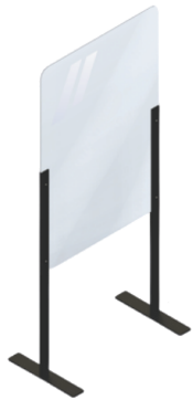
Floor Standing 32" W x 72" H 48" W x 72" H 60" W x 68" H