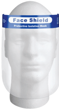
Full Cover Face Shield