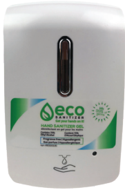
Touch Free Dispenser 1 L Tank