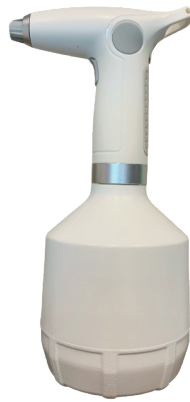
Mini Fogger Mister 1 L Tank