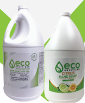
Hand Sanitizer Gel Citrus Hand Soap