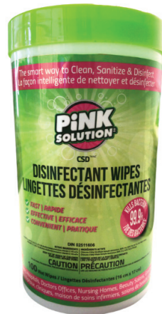
Pink Solution Disinfectant Wipes 100 pcs / Container