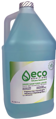
4 L Refill