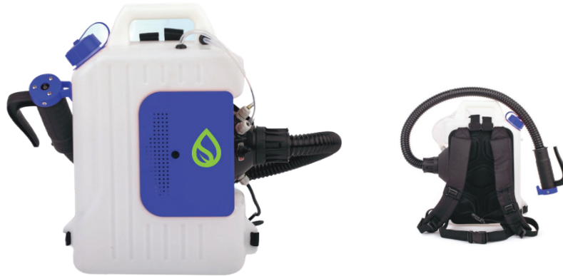
Cobalt Backpack Fogger (Corded)