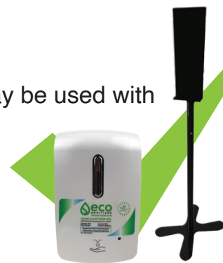
Touch Free Dispenser