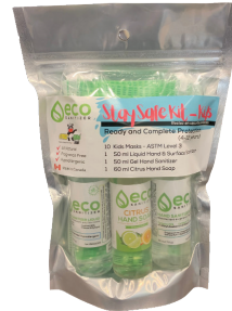
Stay Safe Kit - Kids (4-12 Years)

What's inside: 1 x KN95 Face Mask 1 x 50 ml Liquid Hand & Surface Sanitizer 1 x 50 ml Gel Hand Sanitizer 1 x 60 ml Citrus Hand Soap