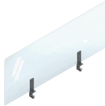
Clamp 60" W x 24" H