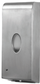
1 L Tango Aloha Wall Mounted Automatic Dispenser