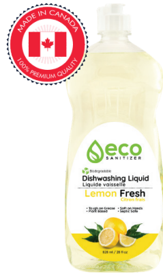
Eco Sanitizer Lemon Fresh Dishwashing Liquid 828 ml / 28 fl oz