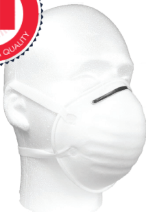
ASTM N95 Disposable Respirator - 5 Layer