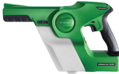
Victory Electrostatic Sprayer Hand Held (Cordless)