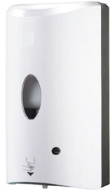
1.2 L Tango Plus Wall Mounted Automatic Soap And Sanitizer Dispenser