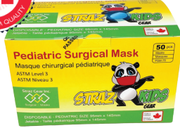
Kids Surgical Mask ASTM Level 3 50 pcs per Box