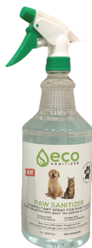
1 L Spray/Refill