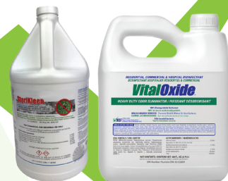
Sterikleen Vital Oxide