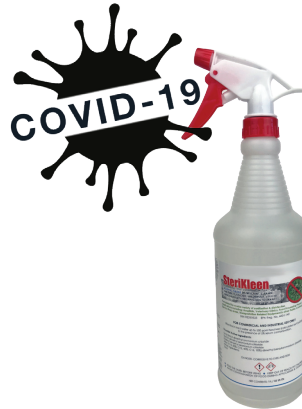
1 L Trigger Spray