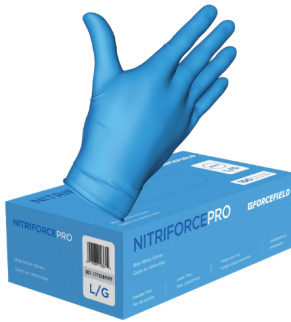
NitriForcePro Nitrile (Blue) 100 pcs per box