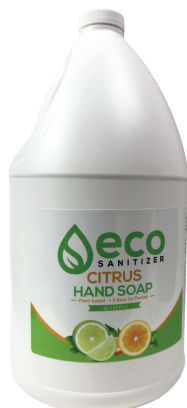
4 L Refill