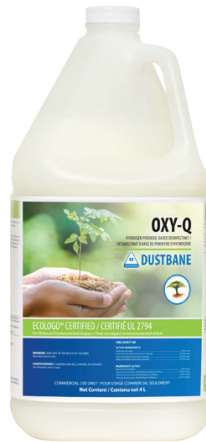
Oxy-Q – Hydrogen Peroxide Based Disinfectant