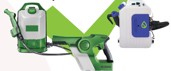
Professional Electrostatic Backpack and HandHeld Sprayers (We supply)