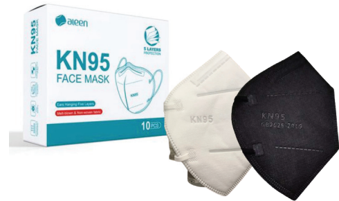
KN95 Face Mask 10 pcs per box