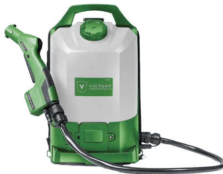
Victory Electrostatic BackPack Sprayer (cordless)