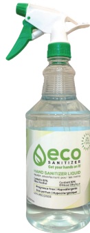
1 L Trigger Spray