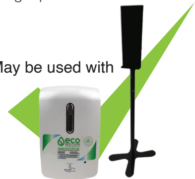
Touch Free Dispenser Dispenser Stand