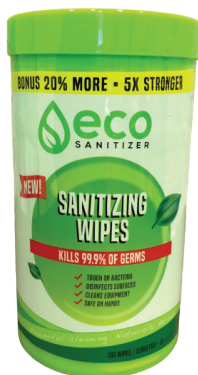
Sanitizing Wipes 100 pcs per Tub