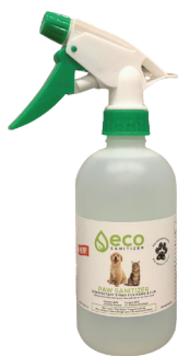
355 ml Spray Nozzle