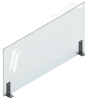
Metal Leg 32" W x 24" H 48" W x 24" H