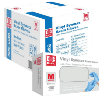
Synmax Poly/Vinyl Blend (Blue) 100 pcs per box