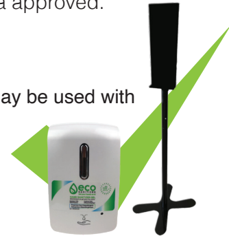
Touch-Free Dispenser Dispenser Stand