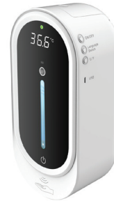
1. L Tapmap Forehead Automatic Sanitizer Dispenser With Built In Thermometer