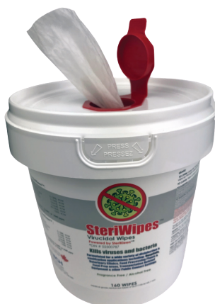
5 L Pail 160 Wipes