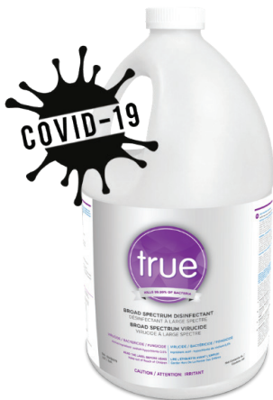
4 L TRUE Disinfectant All Purpose Cleaner