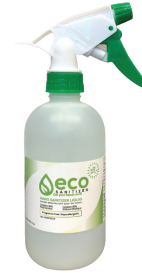
355 ml Trigger Spray