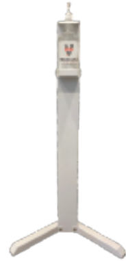
Also Available: Hand Sanitizer Holder Floor Stand