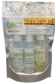
Stay Safe Kit

What's inside: 1 x KN95 Face Mask 1 x 50 ml Liquid Hand & Surface Sanitizer 1 x 50 ml Gel Hand Sanitizer 1 x 60 ml Citrus Hand Soap